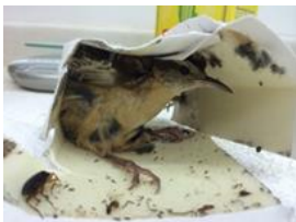
Wren rescued from sticky trap and released.

The new Wildlife Urgent Care facility is expecting to help over 2,000 animals in 2018.